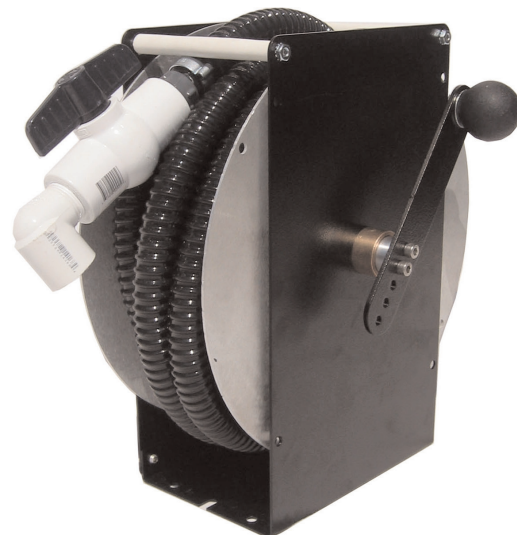
Hand Crank Model #SHW25 9W X 11.5D X 13H